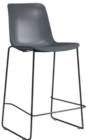
BarZenith ht65 ep01 PZ72