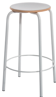
BarTabCollege ht80 ep01 HP00